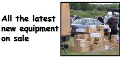
All the latest new equipment on sale

We have a 99.8% success rate with this course & exam!