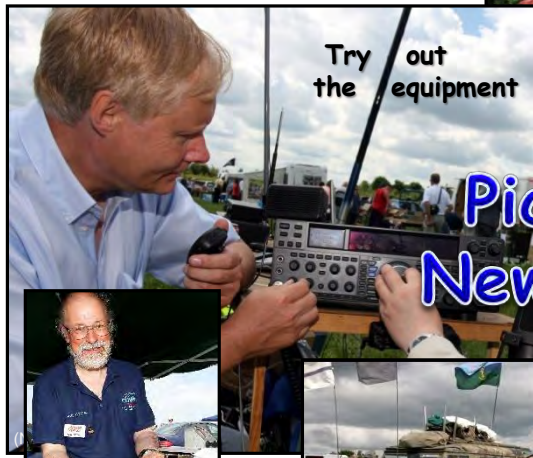
Try out the equipment

Live demonstrations and club stands At the Newbury Radio Rally