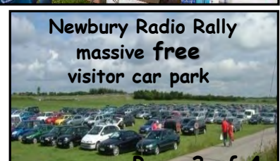
Newbury Radio Rally massive free visitor car park