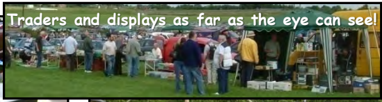
Traders and displays as far as the eye can see!