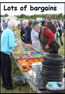
Lots of bargains