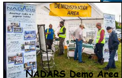
NADARS Demo Area